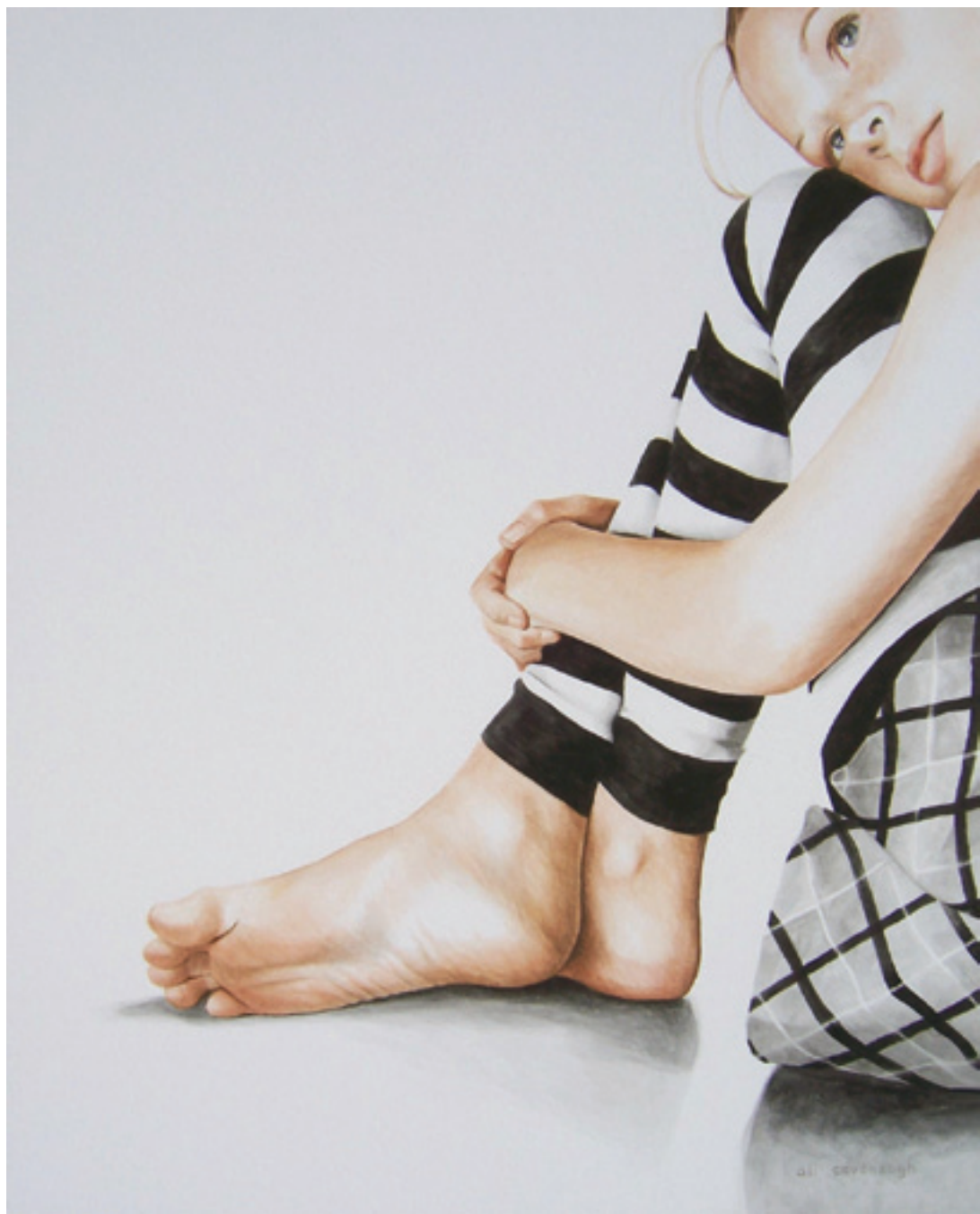
I Remember How It Used To Be 2007, watercolor, 20 x 16. Private collection.

Once she has determined the composition, she selects a panel and