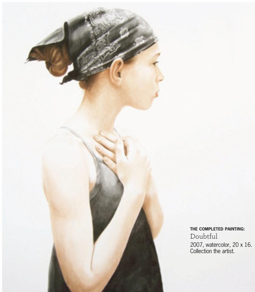
THE COMPLETED PAINTING: