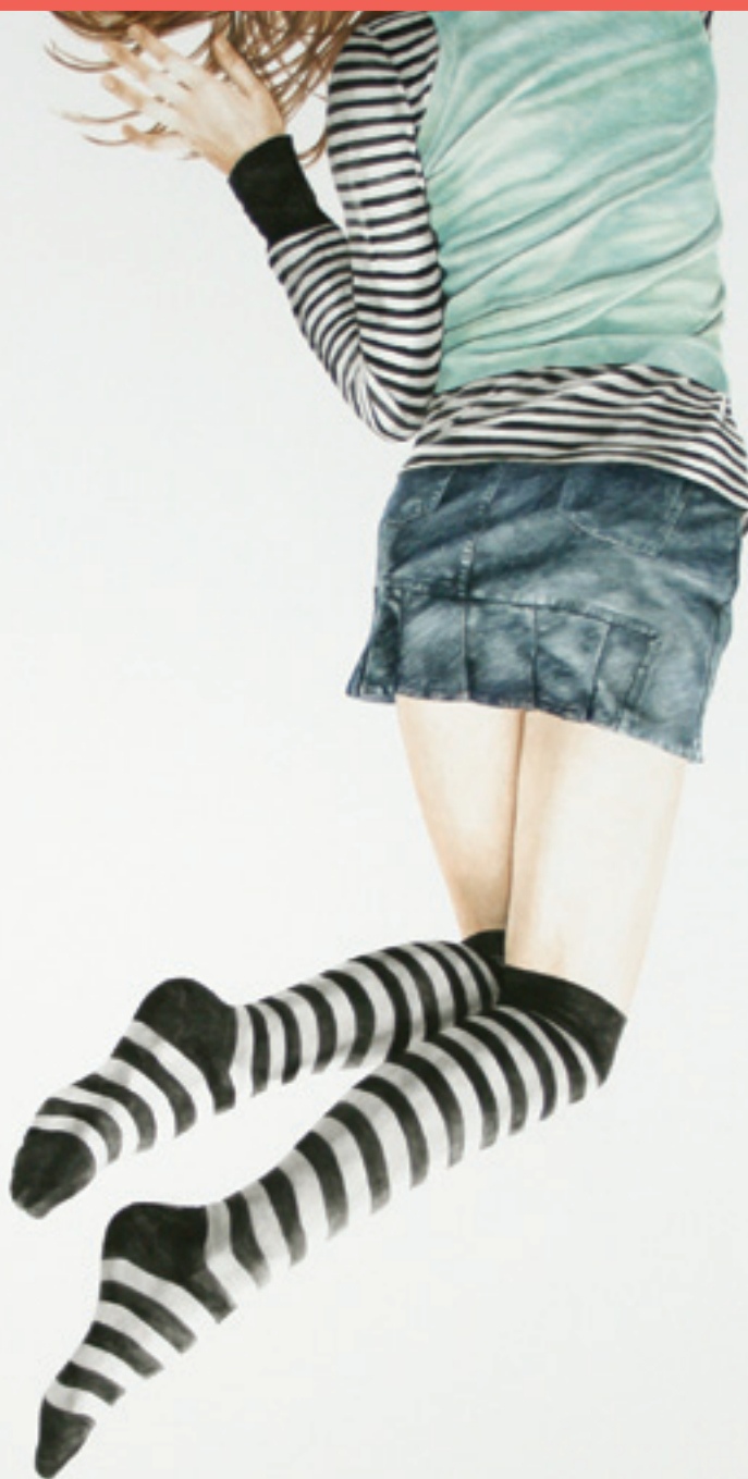
Perfected Through a Fall 2008, watercolor, 50 x 40. Collection the artist.