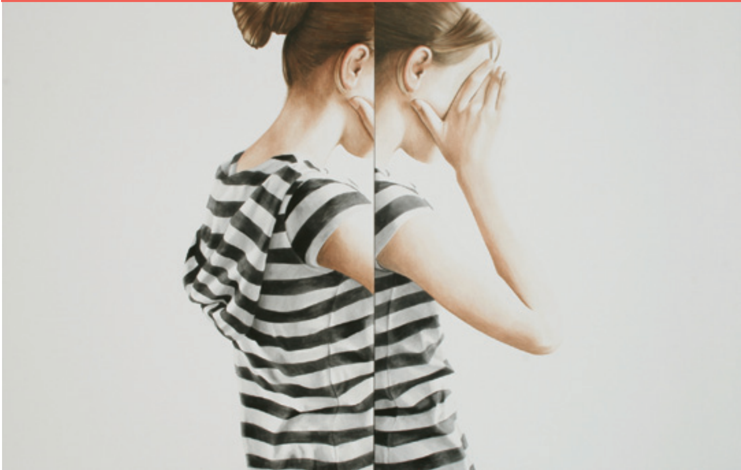
ABOVE Separate My Thought From Yours 2008, watercolor, 18 x 28. Collection the artist.