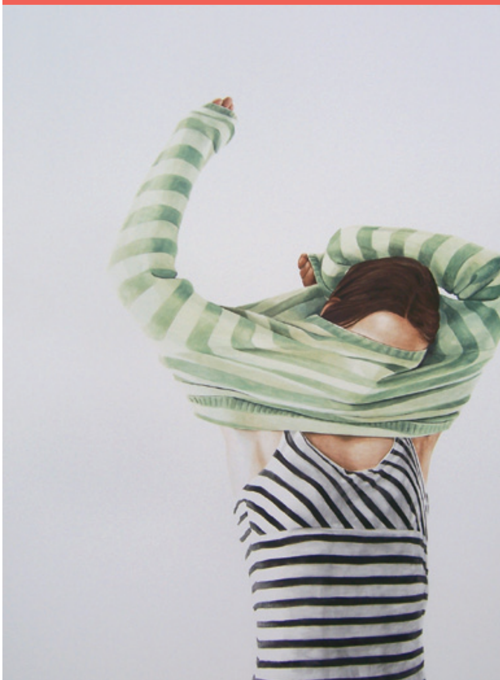
Putting on Perfection 2008, watercolor, 30 x 22. Collection the artist.

She allows each layer of paint to dry before she applies the next, which prevents the previous layers from lifting. Her skin tones typically consist of varying degrees of the following paints: yellow ochre, cadmium red light, cadmium red medium, a variety of purples, sap green, burnt umber,